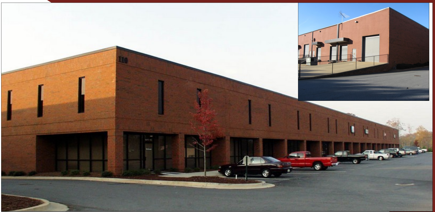
Cobblestone Business Park 100 and 110 Londonderry Road, Woodstock, GA 30188

SIZE: 915 - 3,745 SF RATE: $11.75/SF NET OF JANITORIAL